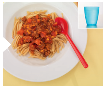
Wholemeal spaghetti + tomato + carrot + minced meat (20–30g) + 1 tablespoon rapeseed oil