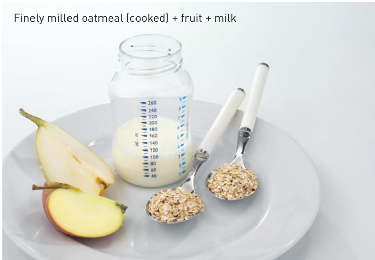
Finely milled oatmeal (cooked) + fruit + milk

Towards the end of your baby's first year of life, they will start to transition from baby food to normal family food.